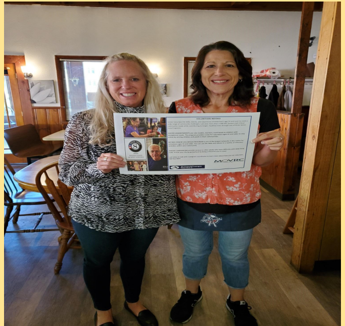
Depot Diner placemat