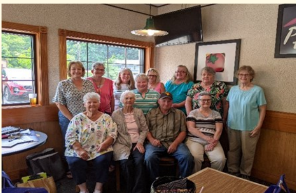
Roane County Foster Grandparents