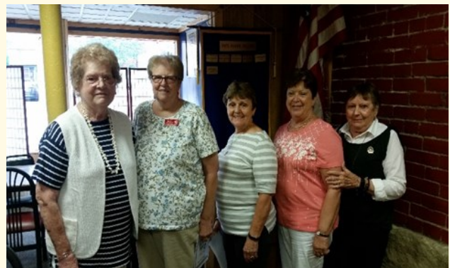
Pleasants County Foster Grandparents