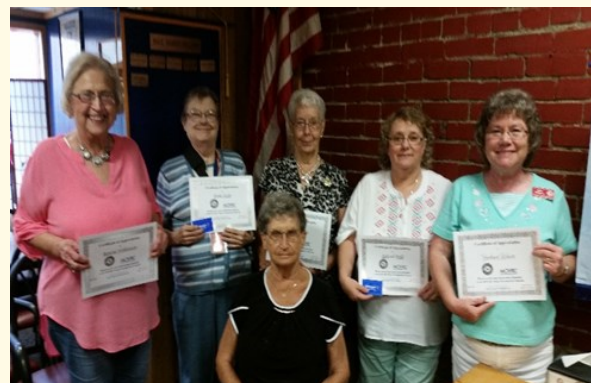
Tyler County Foster Grandparents