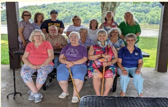
Jackson County Foster Grandparents